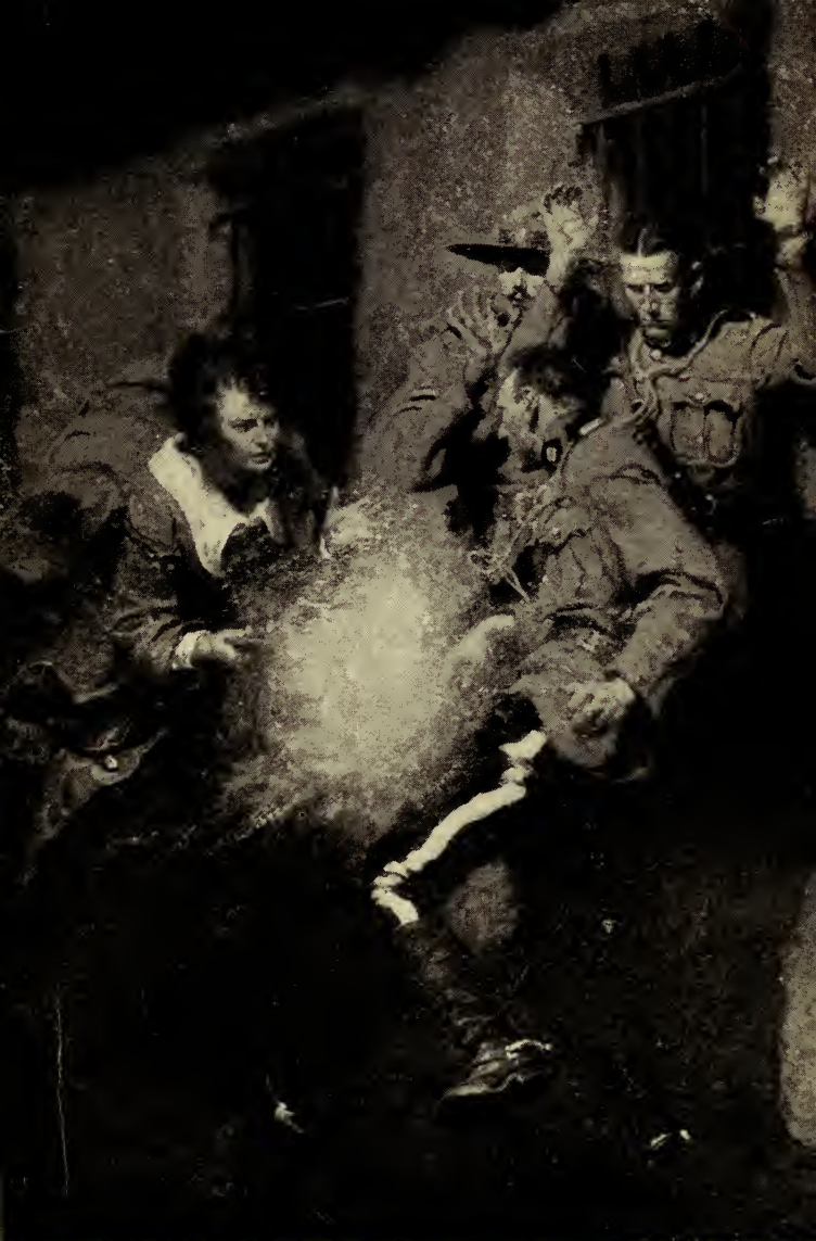
From the girl's revolver leaped fireball